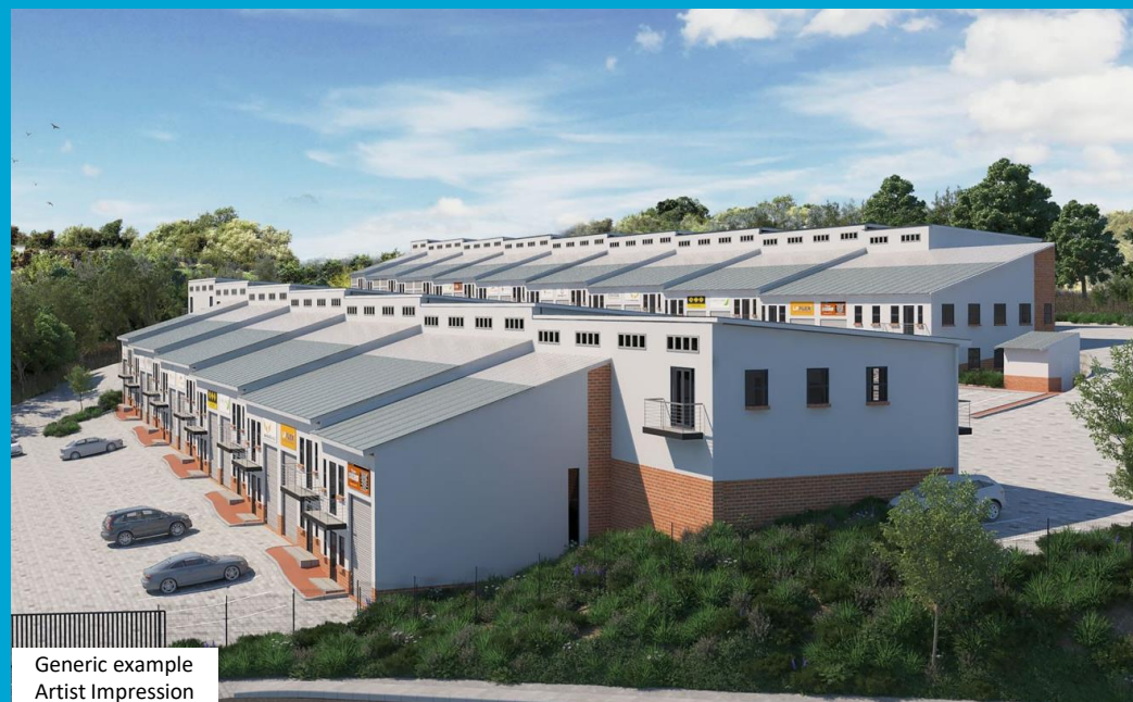
Generic example Artist Impression